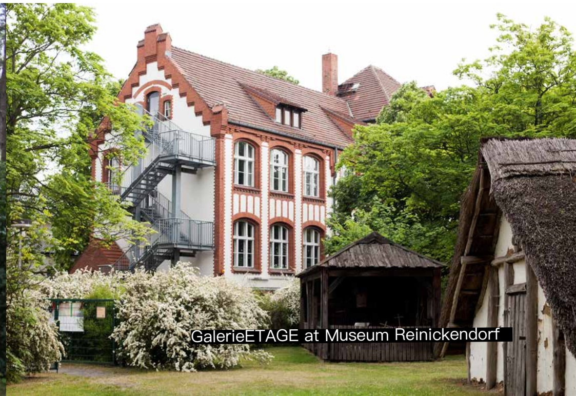
GalerieETAGE at Museum Reinickendorf